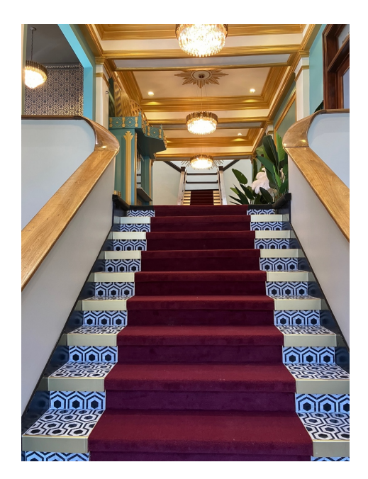
Main lobby and stairs as seen from Walnut Street entrance

Once we are in the door, my family and I can choose to take the elevator or the stairs to the 2nd floor to pick up my tickets, or to the 3rd floor where the show will take place.