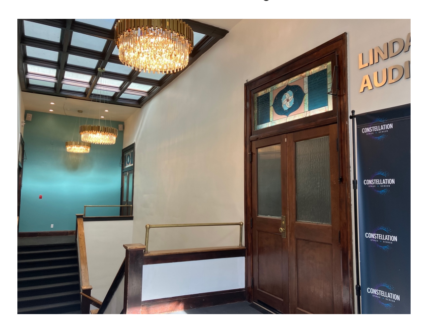
Stairs going down to main lobby and exits

After the performance is over, I can leave the theater with my family. I stay close to my family members so I will stay safe. Once we are out of the doors of the theatre, we can choose to use the stairs or the elevator to get to the door where we entered the building.