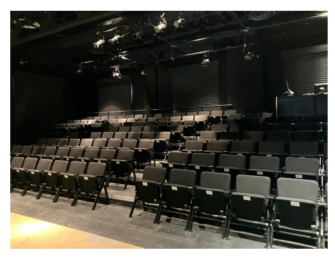
Seating for audience

I can choose to sit in any of the chairs. When choosing my seat, I should consider if I am sensitive to sound (or any of my family members are). The stage manager will sit at a table in the back, close to the door. They will be pushing buttons to control the lights and sounds in the show. These buttons make clicking noises throughout the show. If sound will bother me or a family member, we can sit in the middle of the audience or towards the far end (away from the door). The actors will also talk to the people sitting in first row of the audience. If we don't want to be talked to or interacted with, we can sit in the second row or further back. I will try to make the best choice for seating for my family.