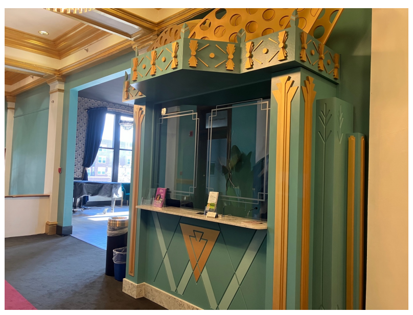
Box office on 2nd Floor for ticket pick-up

Every person must have a ticket to give to the usher to enter the theatre doors. If my family members don't have e-tickets on their phone, then we must stop at the box office to get our tickets. There may be a line that we will need to wait in. I will try to be patient while we wait our turn to get our tickets.