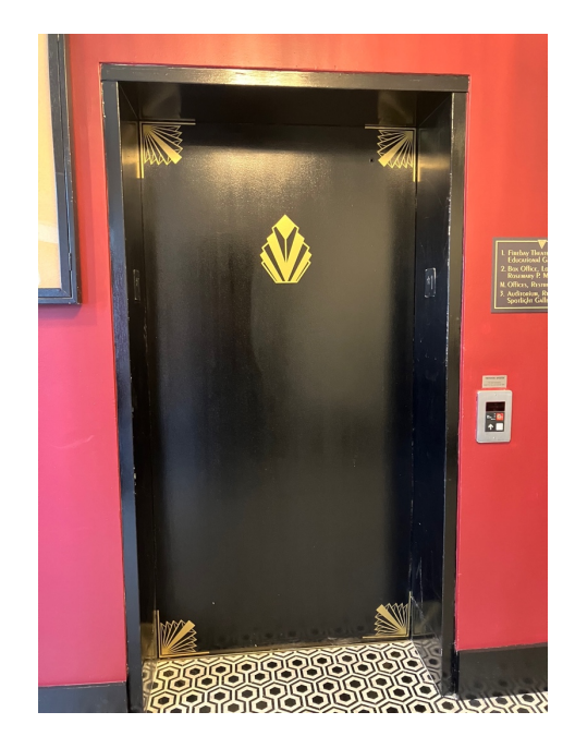
Elevator at 4<sup>th</sup> Street entrance, I can take this to the 3<sup>rd</sup> Floor