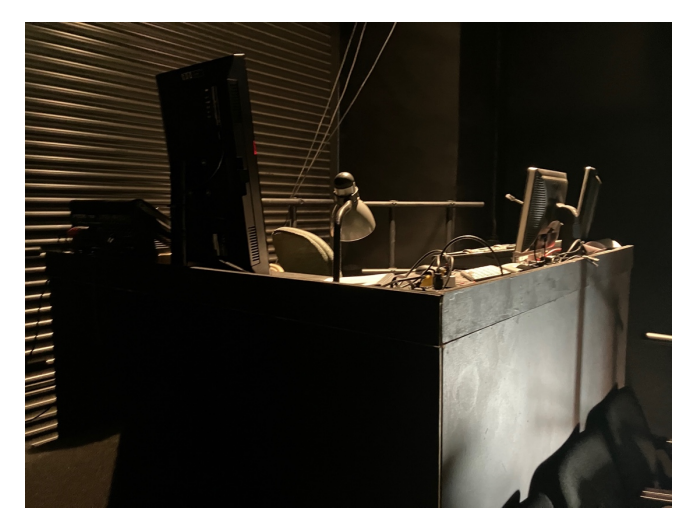
Stage Manager's booth with equipment to run sound and lights