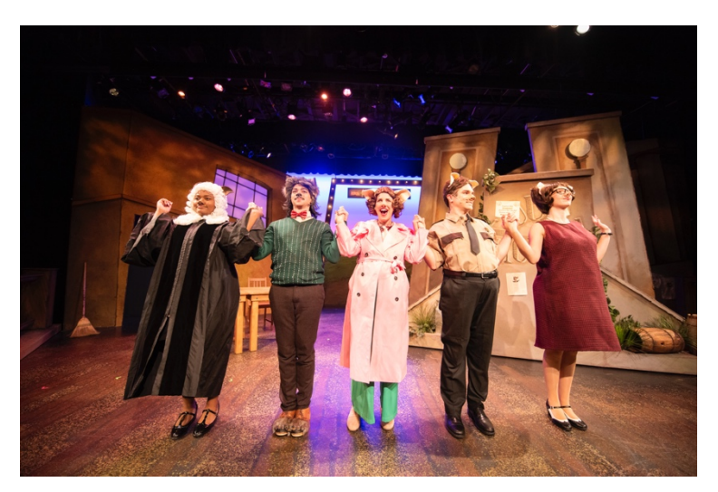
Cast members taking a bow after the performance

At the end of the show, the actors and actresses will bow. During this time, the audience will be clapping to tell the actors they liked the show. I can choose to clap too or cover my ears with my hands or leave my seat to go to the quiet room. I will make the best choice for myself during the times in the show where there are loud noises.