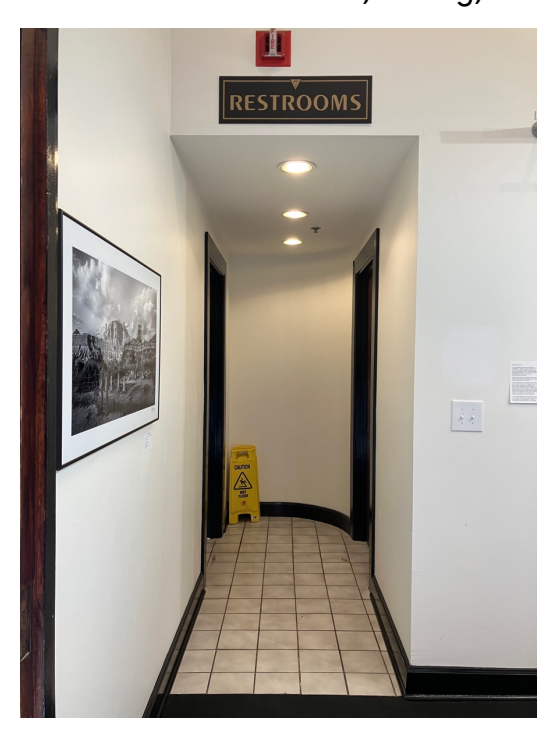
Lobby hallway with bathrooms

I will let my family member know when I have to go to the bathroom. The show is about one hour long. There is no intermission, which means no breaks in the show for the entire audience. I can choose to go to the bathroom before, during, or after the show.