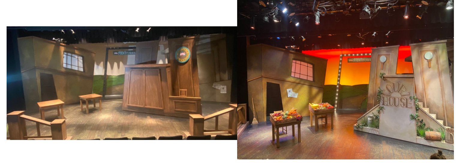
This is what the set will look like during the show.

This is the stage for the True Story of the Three Little Pigs . The Courthouse rotates!