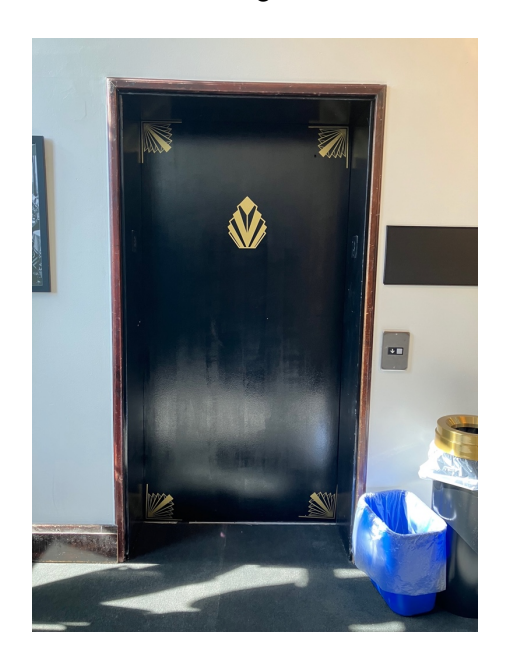
Elevator outside the theater