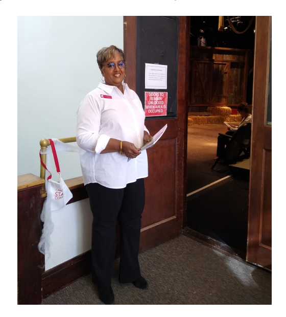
A friendly usher will help me into the theater

An usher will stand at the door of the theatre to collect my ticket. If I need information about what I can do at the theater or where something is located at the theatre, an usher can help me find the information or guide me to the correct place.